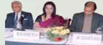
Justice J.S. Verma, Former Chief Justice of India