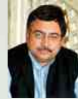
Mr. Vinod Dua, Political Analyst and Media Person