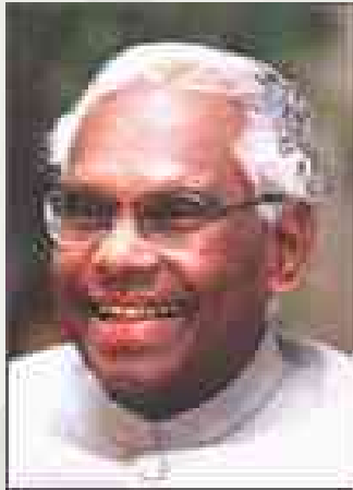
Shri K. R. Narayanan Former President of India -2004