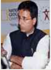
Mr. Randeep Singh Surjewala, Minister, Govt. of Haryana