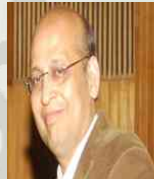
Shri Abhishek Manu Singhvi Member of Parliament (RS) - 2009