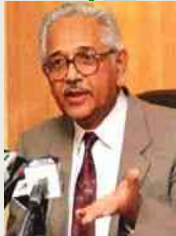
Justice J. S. Verma Former Chief Justice of India -2005