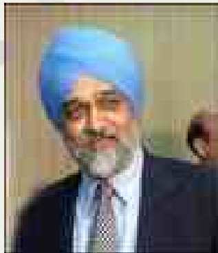
Shri Montek Singh Ahluwalia Dy. Chairman, Planning Commission - 2007